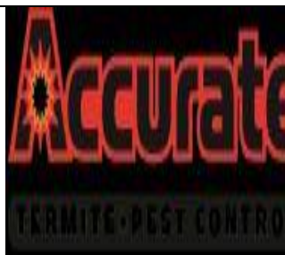
Jim Vitali Accurate Termite Termite Inspections